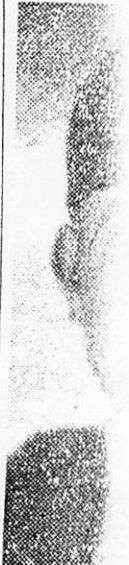
Picture of T. Simpson was reported in days before to the Simpson, the former Winnsboro Tommy...